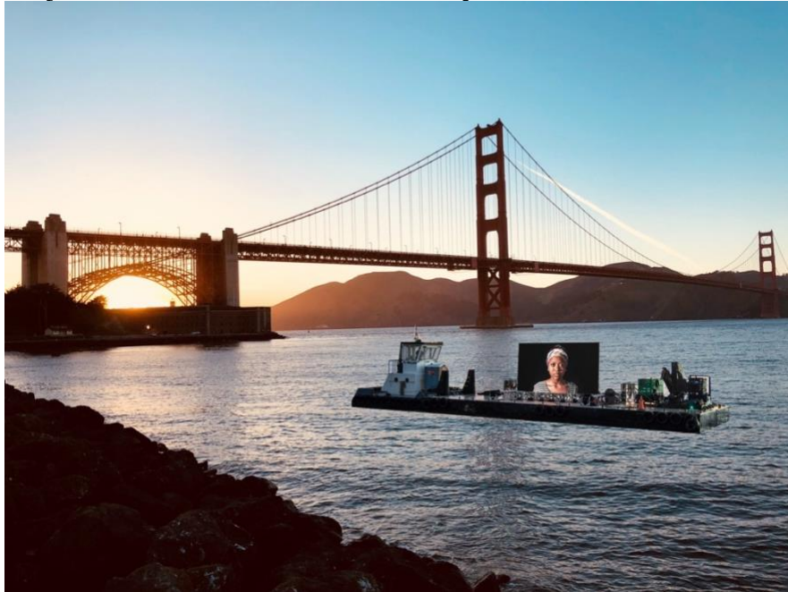
Shimon Attie, Night Watch (rendering on SF Bay).

The Bay Area's First 2021 Multi-City Art + Social Justice Event